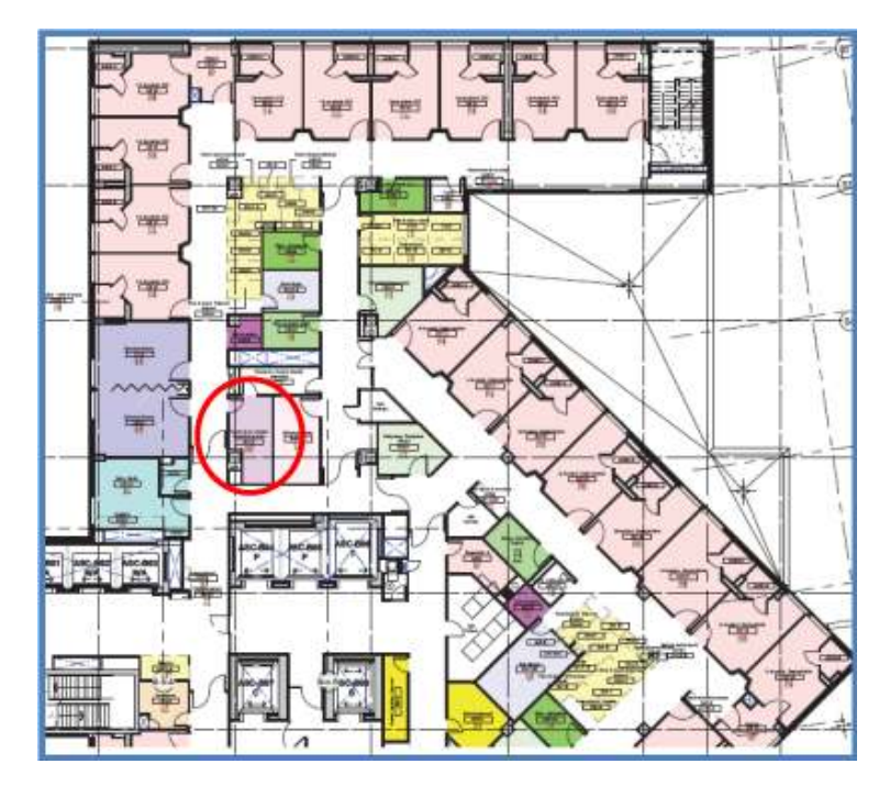
Plan of 8th floor medical/surgical unit showing location of playroom

"Kurling for Kids" Playroom on the Medical/Surgical Ward - Location: 8<sup>th</sup> Floor, Pavillion B, Size: 14.29 m<sup>2</sup> (154 ft<sup>2</sup>)