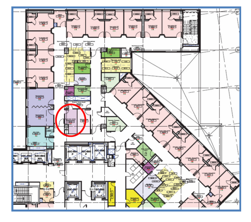
Plan of 8th floor medical/surgical unit showing location of playroom

"Kurling for Kids" Playroom on the Medical/Surgical Ward - Location: 8<sup>th</sup> Floor, Pavillion B, Size: 14.29 m<sup>2</sup> (154 ft<sup>2</sup>)